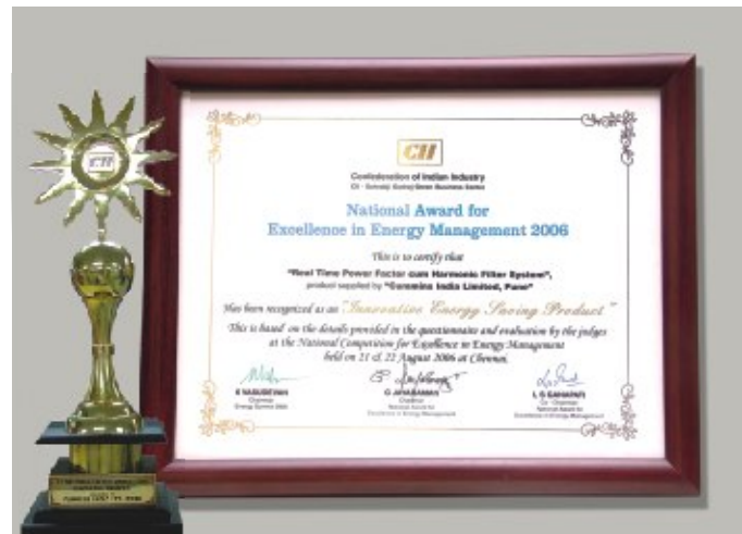
Cummins Power Generation's RTPFC system is the recipient of the prestigious CII national award

Our energy working for you.™ www.cumminsindia.com © 2006 | Cummins Power Generation VW - CH 15 (May 07) - 500